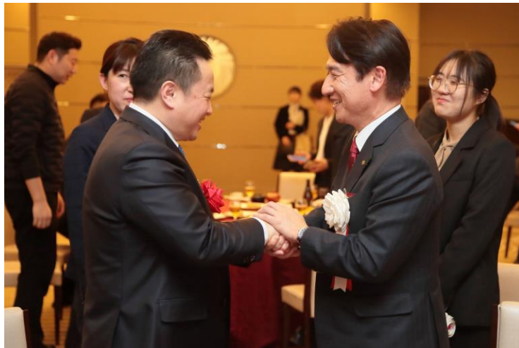
[Dalian and Kitakyushu Friendship City Agreement Date] May 1, 1979

After the press conference, local companies of Kitakyushu that have expanded their business to Dalian had interacted and exchanged with one another.