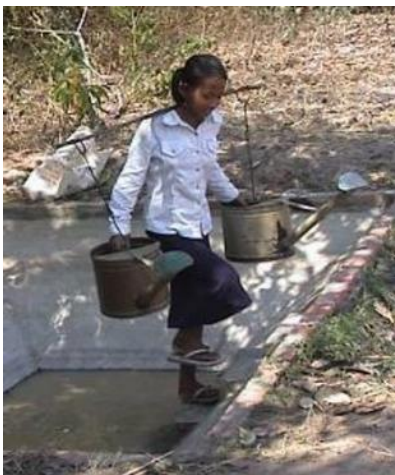
A child fetching water in rural areas

For more than 30 years, the Kitakyushu City Water and Sewerage Bureau has been dedicated to improve the infrastructure, construction, and operation capabilities of people involved in water supply and sewerage in developing countries through technical cooperation, such as dispatching experts and accepting trainees. Especially in Phnom Penh, the capital of Cambodia, as a result of international technical cooperation, the quality of tap water has improved dramatically, achieving "drinkable tap water," which is rare in Southeast Asia. This success has been praised as the "Phnom Penh Miracle" by waterworks officials around the world.