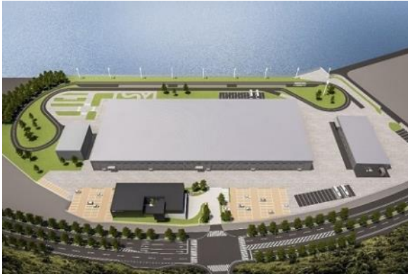
【Generated Image of Completed Facility】

Construction of Japan's first commercial electric vehicle (EV) mass production assembly factory Zero Emission e-PARK has begun in Koyomachi, Wakamatsu Ward.