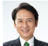
Kyohei Tsurushi Mayor of Kitakyushu City