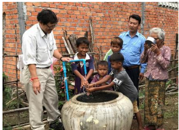
Children happy with the opening of the water supply