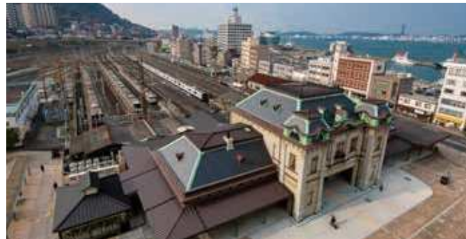
The train tracks of Mojiko Station as seen from the top of the former JR Kyushu Headquarters building