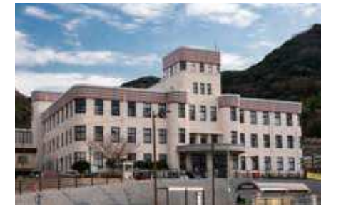
21 Moji Ward Office (Former Moji City Hall) Address: 1-1-1, Kiyotaki, Moji-ku Built in 1930 Blueprint: Kurata Ken