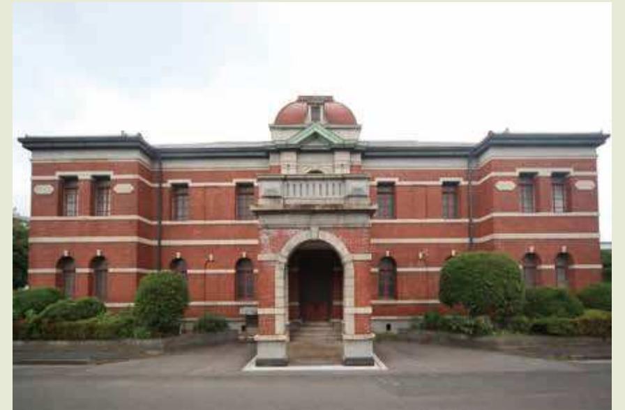
First Head Office

35 The Imperial Steel Works, Japan (First Head Office/Repair Shop/Former Forge Shop) Address: Oaza Ogura, Yahatahigashi-ku The first head office: Built in 1899 The repair shop, The former forge shop: Built in 1900 Blueprint: unknown *The facilities are closed to the public. You can view the buildings from an observation space.