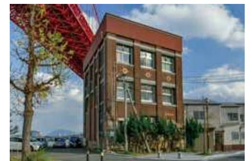
32 Tochiki building Address: 1-15-10, Honmachi, Wakamatsu-ku Built in 1920 Blueprint: Matsuda Shohei