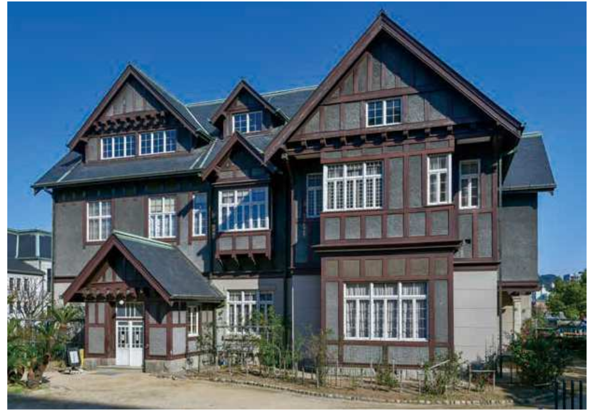
14 Former Moji Mitsui Club (Former Montetsu Kaikan) Address: 7-1, Minatomachi, Moji-ku Built in 1921 Blueprint: Matsuda Shohei