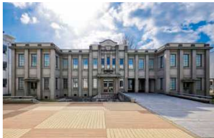
Learning Support Plaza