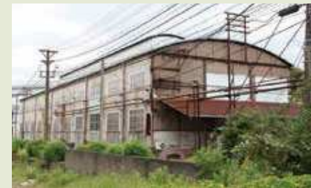
Former Forge Shop