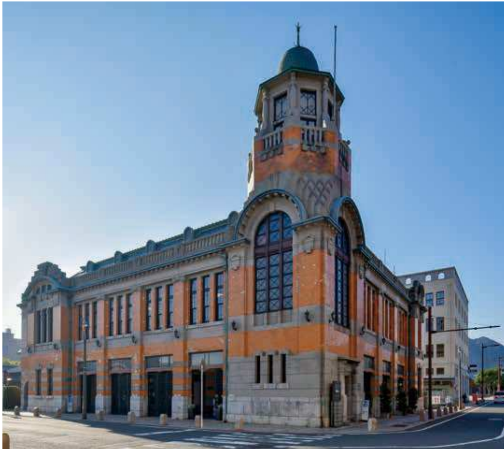
13 Former Mitsui O.S.K. Line building Address: 7-18, Minatomachi, Moji-ku Built in 1917 Blueprint: Kawai Ikuji