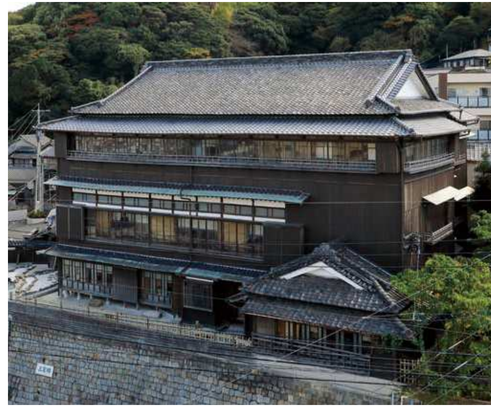
20 Sankiro [historic Japanese restaurant] Address: 3-6-8, Kiyotaki, Moji-ku Built in 1931 Blueprint: unknown