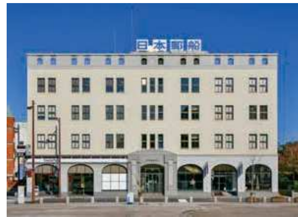
17 Moji Yusen building (Former Moji branch of Nippon Yusen) Address: 7-8, Minatomachi, Moji-ku Built in 1927 Blueprint: Yashima Tomo