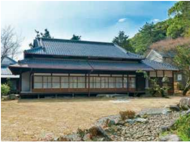
40 Former Yasukawa family residence parlor Address: 1-4-23, Ichieda, Tobata-ku Built in 1912(Relocation) | Blueprint: unknown