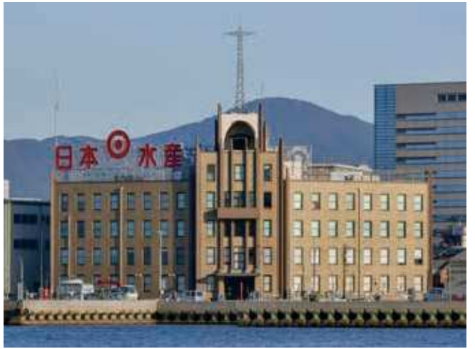
43 Nissui Tobata building (Former Kyodo Gyogyo building) Address: 2-6-27, Ginza, Tobata-ku Built in 1936 | Blueprint: Takenaka Corporation