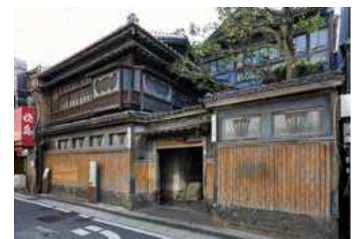
33 Main building of Kinnabe restaurant, front entrance Address: 2-4-22, Honmachi, Wakamatsu-ku Built in around 1917 Blueprint: unknown