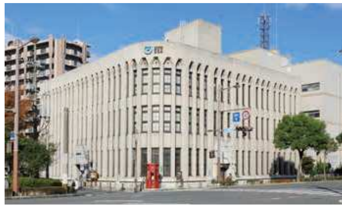
16 Moji Telecommunication Museum (Former Moji Post Office Electrical Division) Address: 4-1, Hamamachi, Moji-ku Built in 1924 Blueprint: Yamada Mamoru (Ministry of Communications)