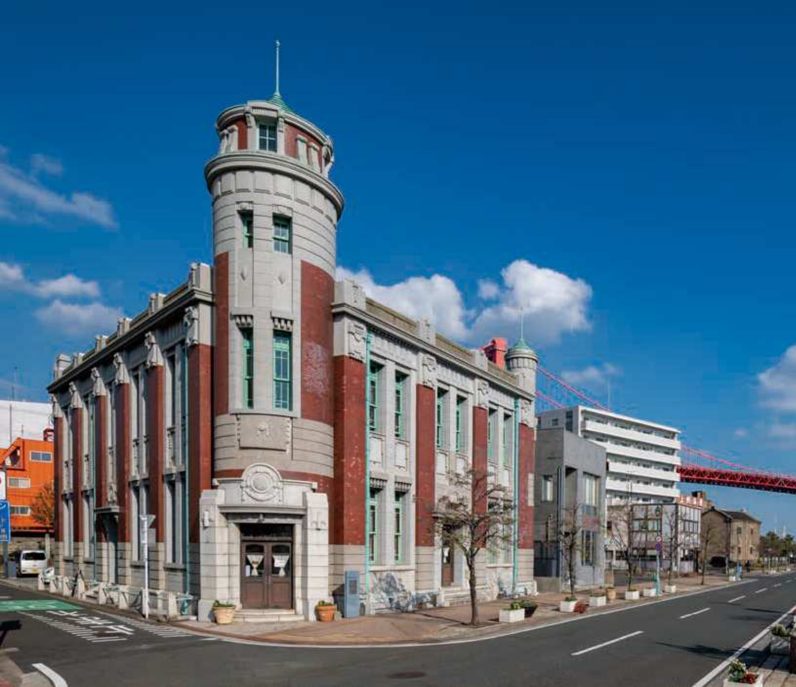
28 Former Furukawa Mining, Wakamatsu building Address: 1-11-18, Honmachi, Wakamatsu-ku Built in 1919 Blueprint: unknown