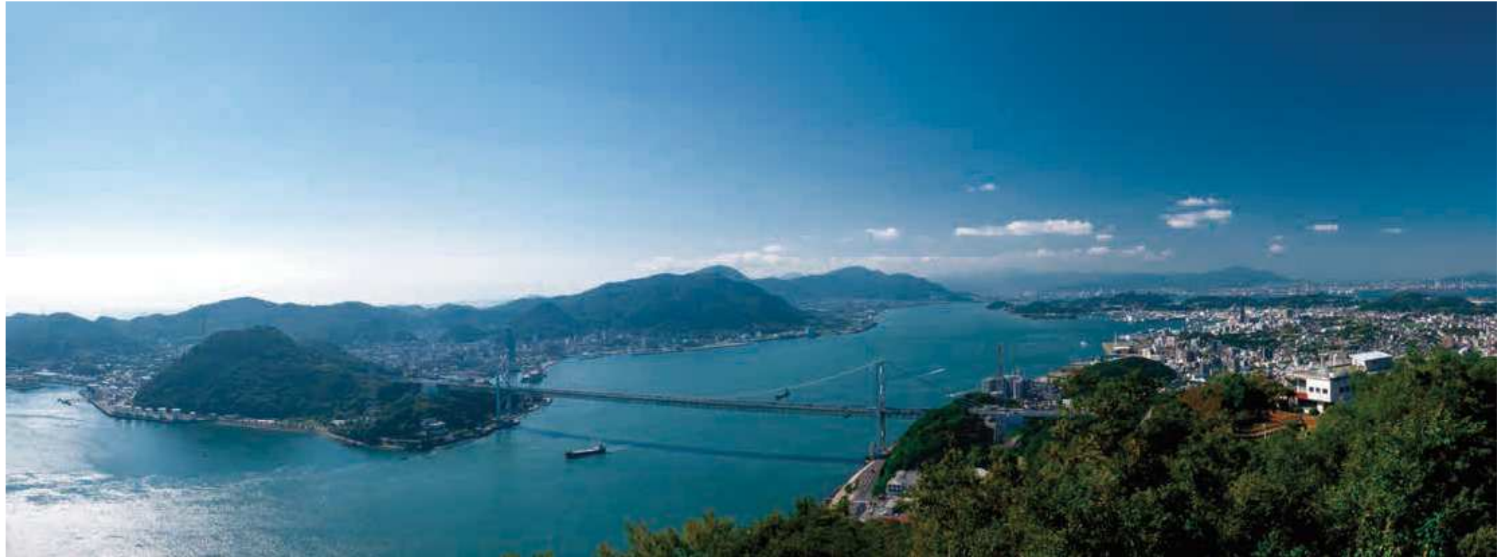
12 A view of the Kanmon Strait (as seen from the Hinoyama Park observatory, Shimonoseki City)