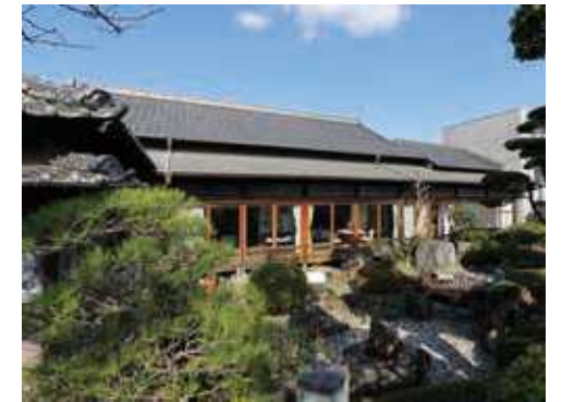
31 Hino Ashihei Residence "Kahaku Do" Address: 1-16-18, Hakusan, Wakamatsu-ku Built in 1940 Blueprint: unknown