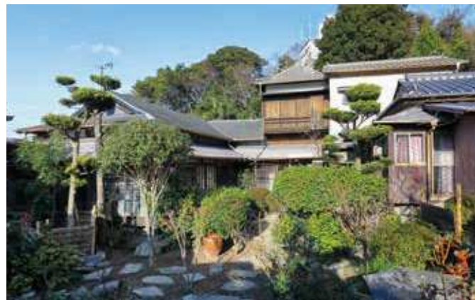
18 Mojiko Ryozaitei (Former Maruyama Villa) Address: 2-12-6, Maruyama, Moji-ku Built in 1925-1934 Blueprint: unknown