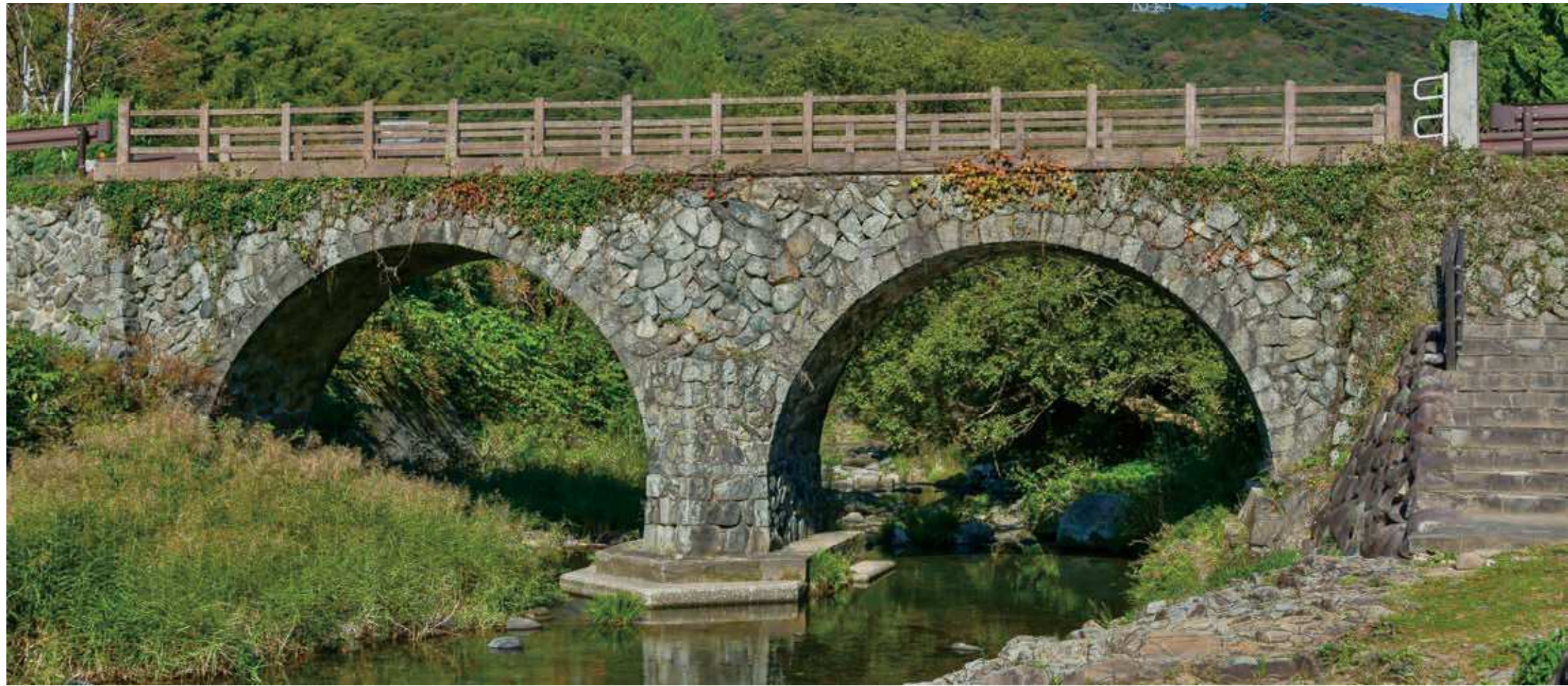
38 Haruyoshi Megane Bridge | Address: 397-7, Haruyoshi, Kokuraminami-ku | Built in 1919 | Blueprint: unknown