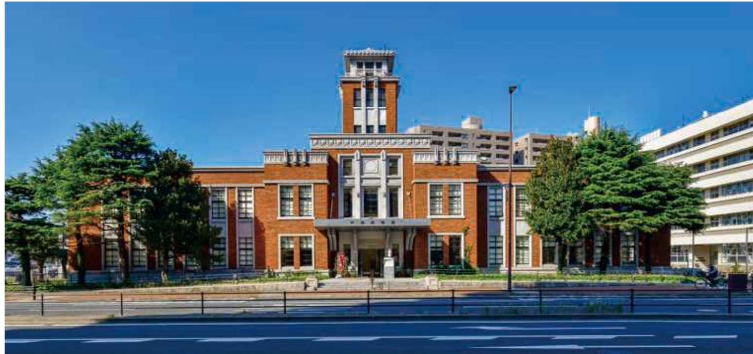
39 Tobata Public Library (Former Tobata City Hall) Address: 1-1-1, Shin-ike, Tobata-ku | Renovation 2014 | Blueprint: Shigeru Aoki Architect & Associates Address: Same as above | Built in 1933 | Blueprint: Fukuoka Prefecture Repair Division