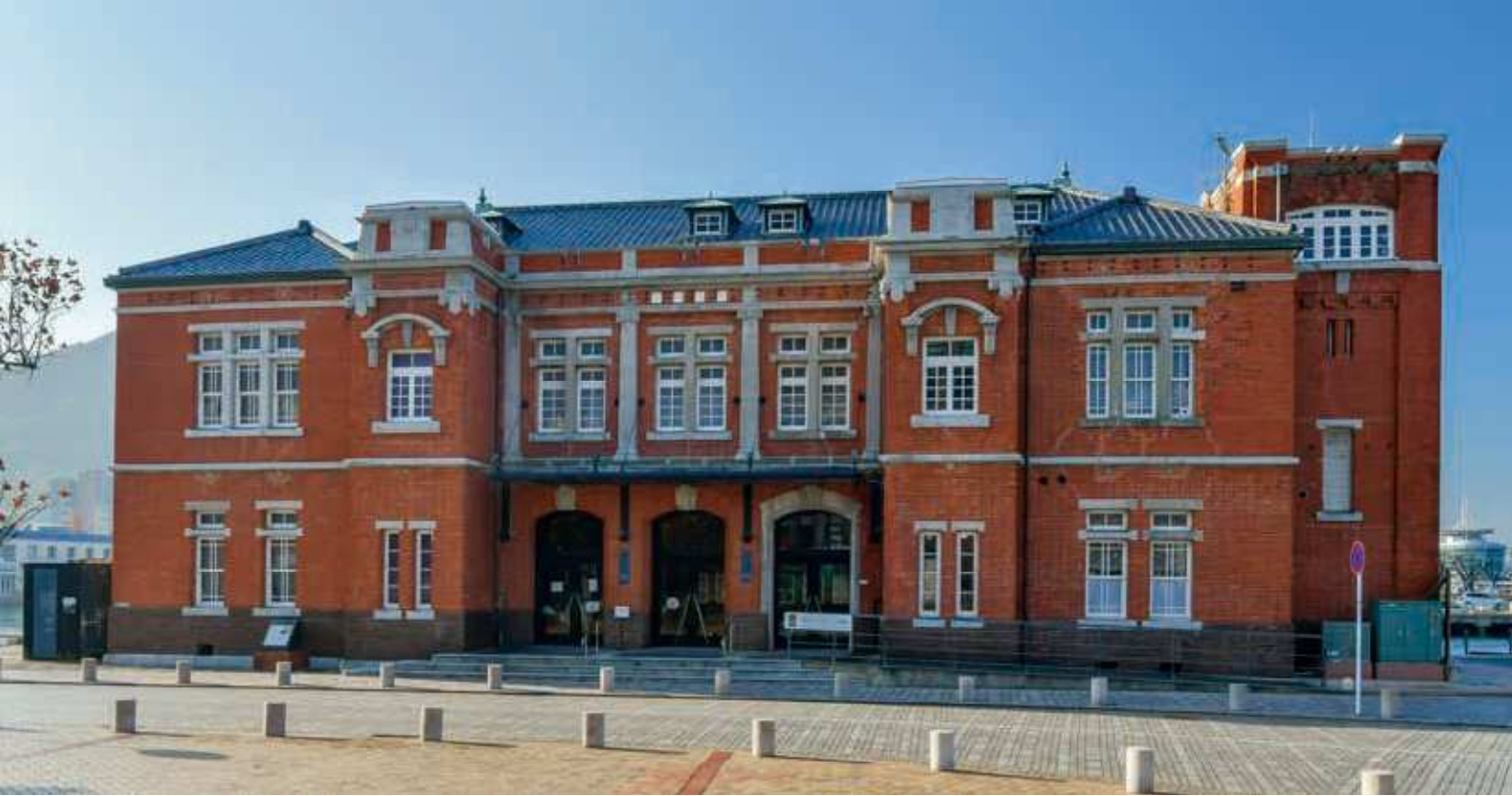
15 Former Moji Customs building Address: 1-24, Higashiminatomachi, Moji-ku Built in 1912 Blueprint: Tsumaki Yorinaka / Sakuju Eiichi (Ministry of Finance Architecture Division)