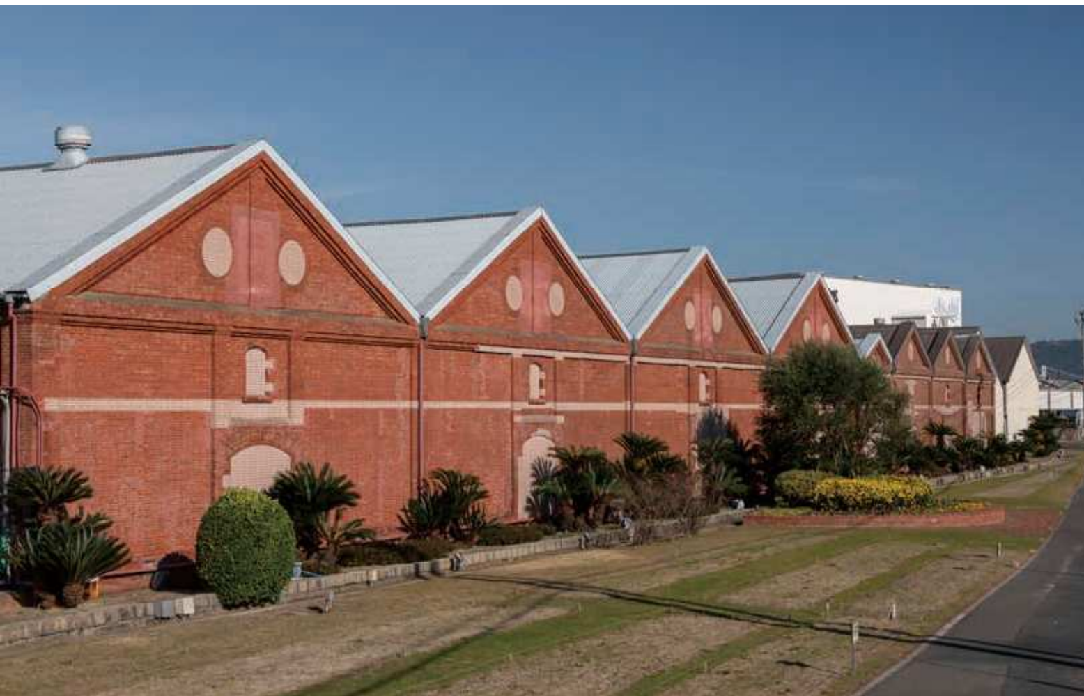
26 Nikka Whisky Moji Distillery Warehouses (Former Daiiri Mill Repository) Address: 2-1, Dairimotomachi, Moji-ku Built in 1916 Blueprint: unknown *Closed to the public.