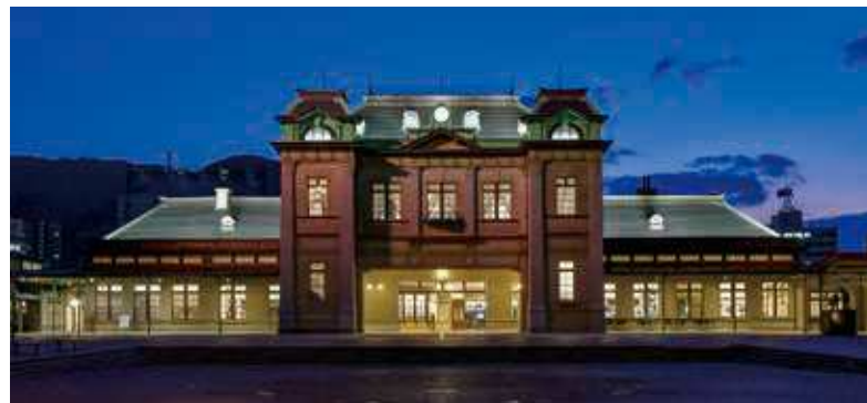
Mojiko Station lit up at night