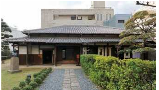
42 Mori Ogai Residence Address: 1-7-2, Kajimachi, Kokurakita-ku Built in around 1897 | Blueprint: unknown