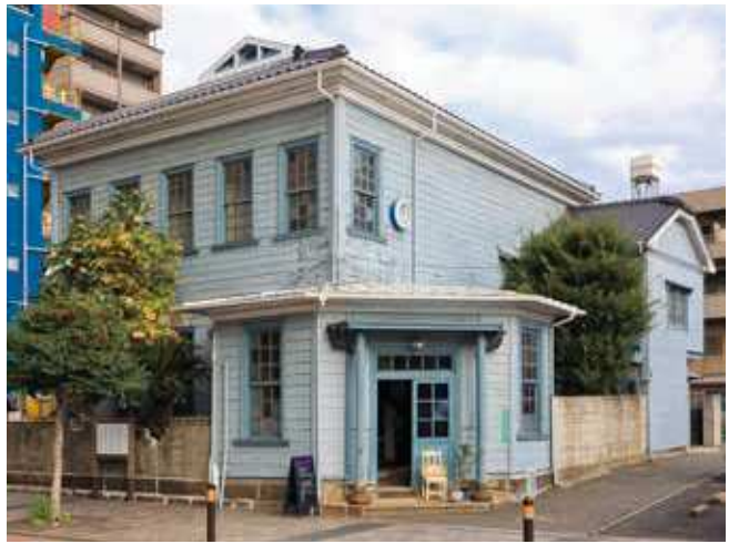
41 BLUE BLUE KOKURA (Former Kokura Police Station building) Address: 2-2-1, Muromachi, Kokurakita-ku Built in 1890 | Blueprint: Shirouzu Sekijiro (probably)