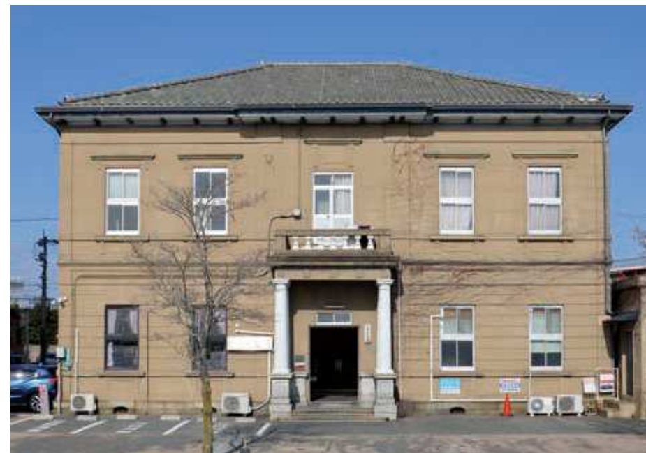
30 Sekitan Kaikan (Former Wakamatsu Miners' Union) Address: 1-13-15, Honmachi, Wakamatsu-ku Built in 1905 Blueprint: unknown