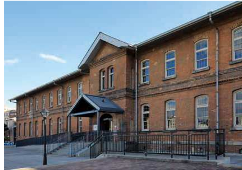
25 Kyushu Railway History Museum (Former Kyushu Railway Headquarters) Address: 2-3-29, Kiyotaki, Moji-ku Built in 1891 Blueprint: unknown