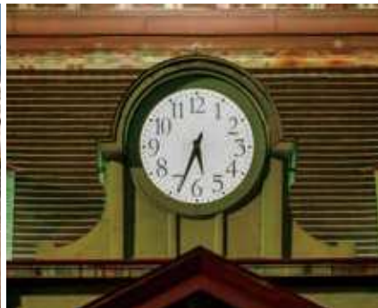
The large clock on the roof