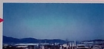
Mountains of Wakamatsu Ward on the opposite side of Dokai Bay can be seen clearly.