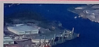
After dredging the bay, a lot of fish came back.