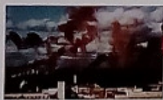
Pollution (air pollution) in the 1960s "Kitakyushu Industrial Area" with smoke of various colors