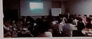
Activities at community-center

To enhance and propagate the cooperation in ESD activities all over Kyushu.