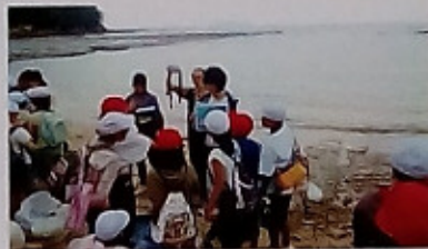
Environmental education in Ainoshima Island (in Kokurakita-ku)

Efforts are made to foster ESD coordinators who will be the key persons for arrangement and coordination to propagate ESD activities.