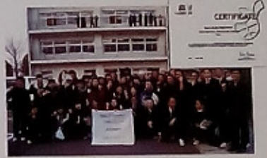
International exchange between Ogura Junior High School (in Yahatahigashi-ku) and RCE Tongyeong (in Korea)

College students and elementary school children learn ESD through experiencing fishing and collecting garbage floating in the ocean.