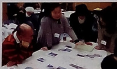
ESD future creation seminar

~ Fostering human resources to successfully become an Environmental Capital of the World ~