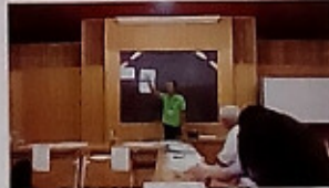
Kyushu ESD Network Promotion Council

To enhance and propagate the cooperation in ESD activities all over Kyushu.